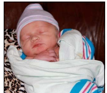
There are no words... well, except, "perfect"